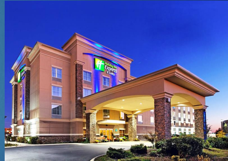
Hotel Review of Utilities and HVAC units