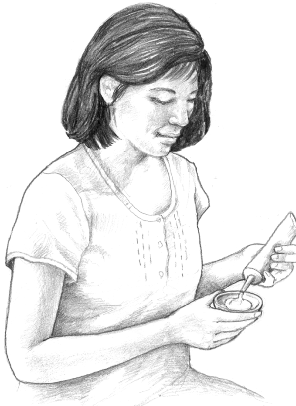
You can put the diaphragm in up to 6 hours before having sex.

You must go to a health care provider for a fitting. You can buy the birth control cream or jelly to use with it in a drugstore or supermarket.