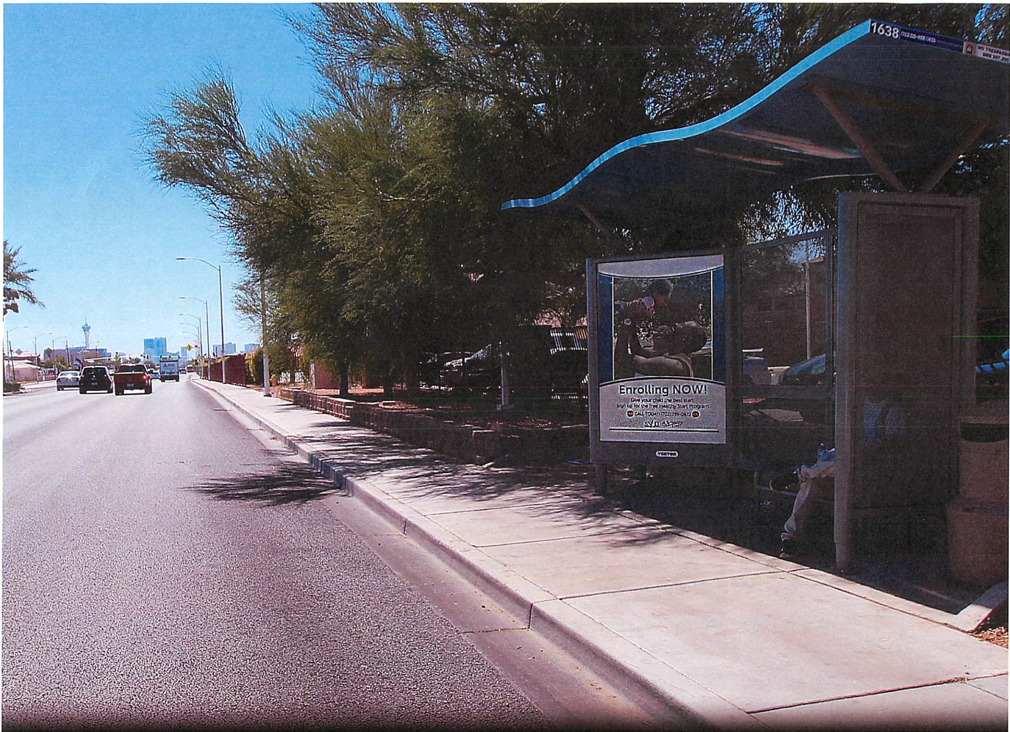
- HEALTHY START / LAS VEGAS / BUS SHELTER