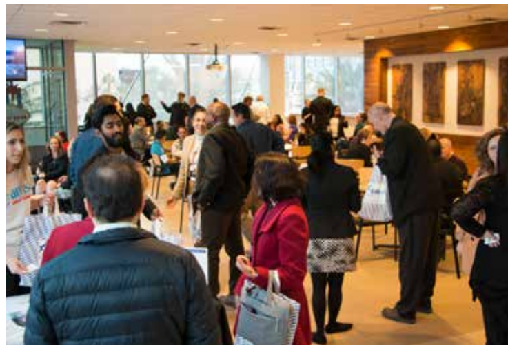
The event drew over 200 attendees