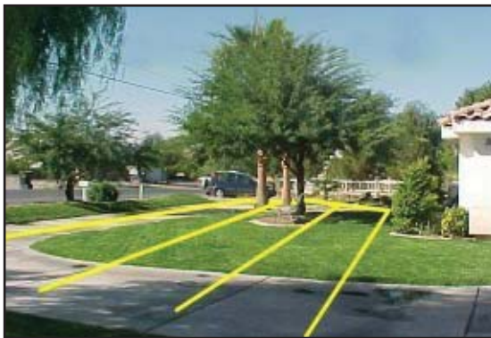
Individual sewage disposal systems with tree and driveway over the absorption field area.

DON'T drive over your tank or any buried components of your system.