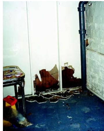
Photo 3B: Front side of wall-board looks fine, but the back side is covered with mold