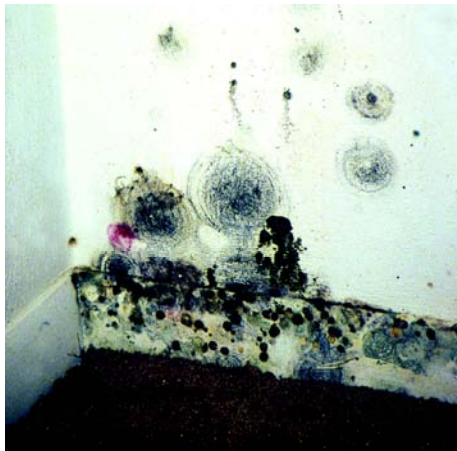
Photo 3A: Mold growing in closet as a result of condensation from room air