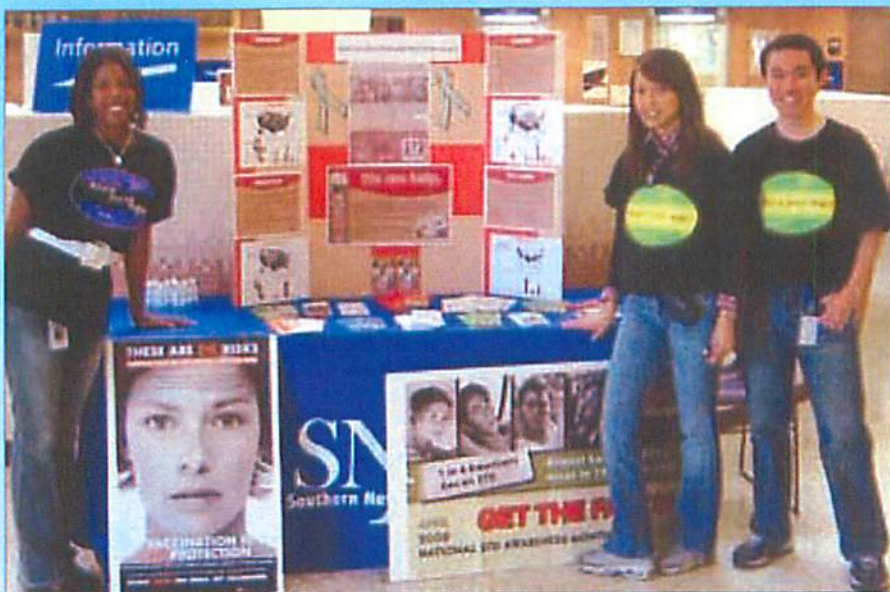
Top: USN student pharmacists created a poster display to communicate the Know your Sign Campaign, which promoted STD testing and awareness.